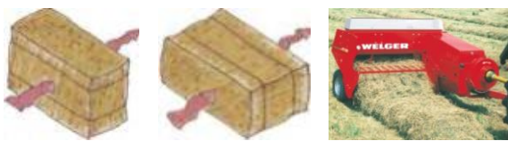
Figure 1, left: thermal flux perpendicular to the direction of the stalks, \lambda = 0.052 W/(mK) © PHI. Center: Thermal flux in the direction of the stalks: 0.08 W/(mK) © PHI. Right: 2-string baler. © Welger.

Anisotropic behavior. The effect of anisotropic behavior is well known from timber. If thermal flux is perpendicular to the fiber, the conductivity ( \lambda ) of softwood is around 0.13 W/(mK). In the direction of the fiber, the conductivity is about 0.29 W/(mK). In the process of straw bale production, the straw stalks are pressed into bales with a certain orientation. A high proportion of the stalks are oriented perpendicular to the binding strings, which causes a similar effect to that reported for timber. In the case of 2-string bales (small bales 0.36 m high, 0.48 m width and 0.6 ... 1.2 m length of a density around 100 kg/m 3 ), the rated thermal conductivity \lambda_R can be assumed as 0.052 W/(mK) where thermal flux is perpendicular to the direction of the stalks, and 0.080 W/(mK) in direction of the stalks.